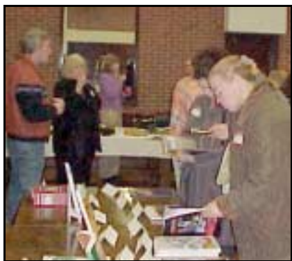
Attendees enjoy the food and peruse the materials.