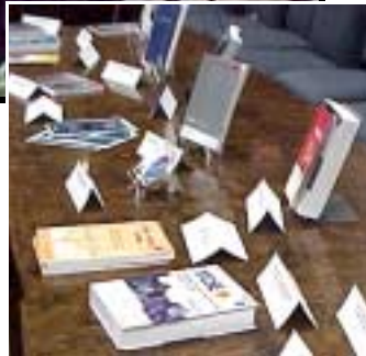
Right: Winning entries were available for inspection.

Alumni Center allowed the chapter to introduce students to the field of technical communication and STC.