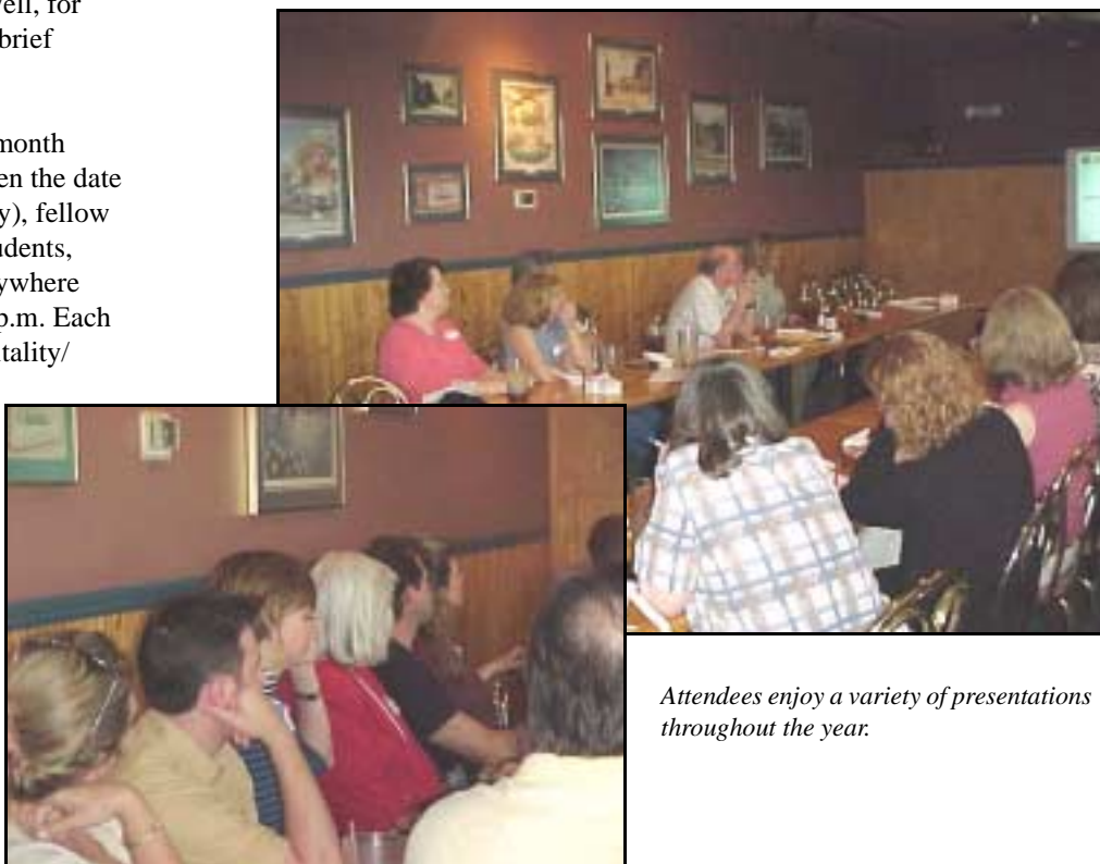
Attendees enjoy a variety of presentations throughout the year.